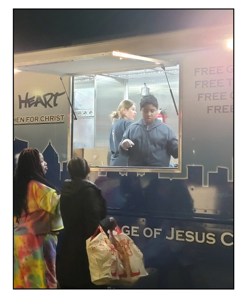
A servant distributes hot meals at Thurston Road and Chili Avenue.

He politely declined saying, "I want to share my problems. This sermon brought them to life..."