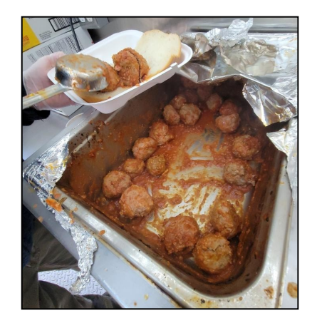
Homemade meatballs are served at Hudson and Durnan.

Through AmazonSmile, The Father's Heart receives a donation from Amazon of 0.5 percent of your purchase price, at no cost to you. To sign up, go to smile.amazon.com on your computer or mobile device. On your first visit, you will be asked to select a charity. Enter "Fathers Heart Ministry Roc Inc" in the box that says "Or pick your own charitable organization." You'll be directed to the Amazon website for shopping as usual.