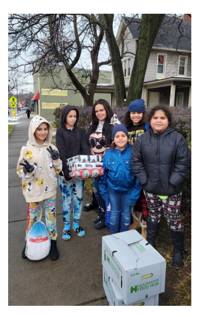
This family was blessed with food and gifts at the Christmas outreach.

"FOR SUCH a High Priest was fitting for us, who is holy, harmless, undefiled, separate from sinners, and has become higher than the heavens; who does not need daily, as those high priests, to offer up sacrifices, first for His own sins and then for the people's, for this He did once for all when He offered up Himself. For the law appoints as high priests men who have weakness, but the word of the oath, which came after the law, appoints the Son who has been perfected forever."