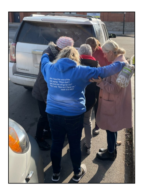
Servants of Redeeming Love pray with a woman on Jay Street on the day they distributed hot meals and gifts to those in need.

THERE HAVE been so many times when we pull up to a woman on a street corner and she says, "You guys are just in