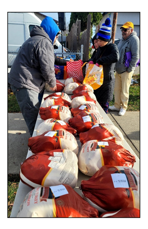
More than 240 turkeys were distributed at the Thanksgiving outreach.

WE GAVE out more than 240 turkeys and side bags of fixings, along with 430 hot meals. Every side bag Continued on Page 2