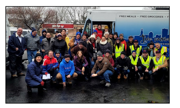
Above, volunteers at the Christmas outreach. At right, some gifts for children.