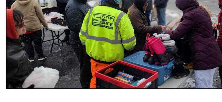
The clothing line at a Lake Avenue outreach has warm winter boots.

Unless noted otherwise, all scripture in the newsletter is from the New King James Version.