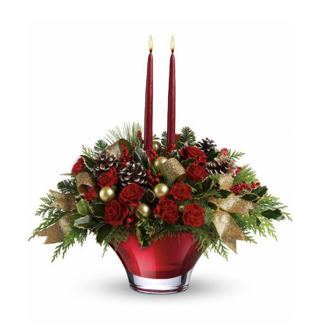
Altar Flowers Are given by the Nowlans for blessings received!